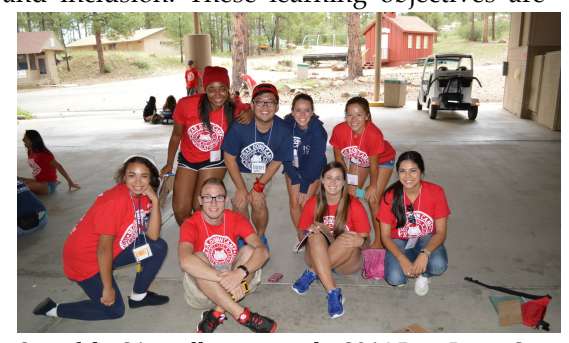
One of the 31 small groups at the 2014 Bear Down Camp

Bear Down Camp is grounded in Schlossberg's Transition Theory. The theory (1995) notes how individuals process transitions, and the four factors that control an individual's ability to cope with the transition. Two of the major factors are support, primarily social support, and strategies, potential ways that individuals may respond to